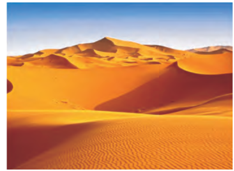
The Sahara Desert

second largest of the seven continents. It is surrounded by oceans on all sides : the Indian Ocean in the east, the Atlantic Ocean in the west, the Southern Ocean in the south and the Mediterranean Sea in the north which separates it from Europe. More than half of this continent is covered with dry land and deserts. Sahara Desert in Africa is the hottest desert in the world. The Equator passes through the continent due to which it has great climatic variations.