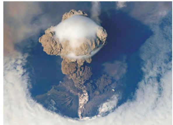
The Pacific Ring of Fire

The Pacific Ring of Fire is a horse-shoe shaped area in the Pacific basin, which is home to almost 75 percent of the world's active and dormant volcanoes. This is also one of the most earthquake sensitive zones in the world. Frequent tremors that are experienced around the globe every year are emerged from this pacific basin. The Mariana Trench in the Pacific Ocean is the deepest point of the Earth.