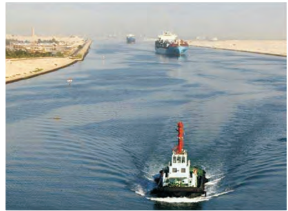
The Suez Canal

Sea water can also be less saline near land, where rivers add freshwater. The ocean around Antarctica has a low salinity of just below 34 ppt, and around the Arctic ocean, it is down to 30 ppt in places.