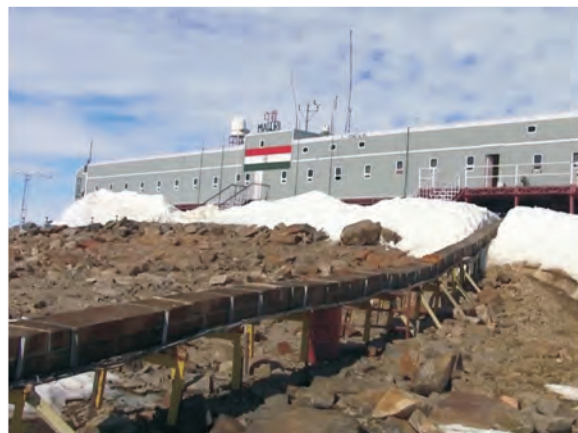
Maitri, India's second permanent research station in Antarctica, was built on the rocking mountainous region named Schirmacher Oasis

Australia, is often also known as the 'Island continent' because it is the smallest continent in the world. But, despite being small, it is one of the most developed countries in the world in all respects and standards.