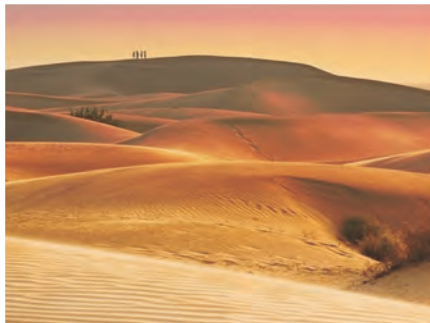
The Thar Desert