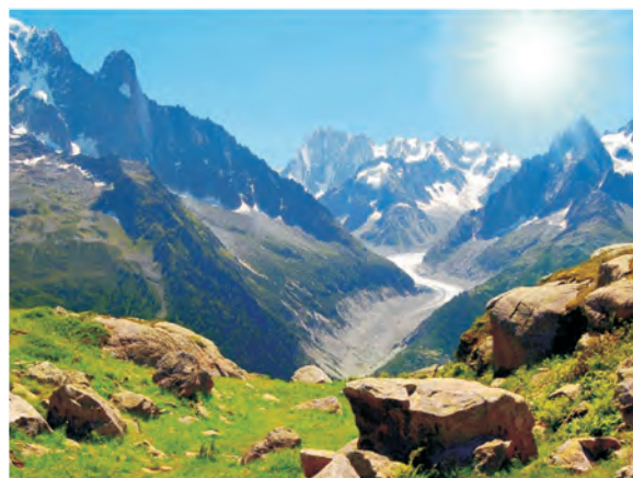
The Alps Mountain Range

The majority of Antarctica is covered in ice (20 million square kilometres) and only 1% is permanently ice-free. This ice, with an average thickness of 1.6 km contributes to 90% of the world's fresh water.