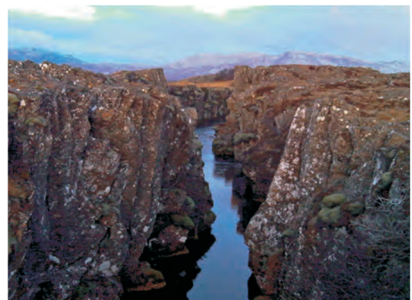
The Mid-Atlantic Ridge

The Mid-Atlantic Ridge is a big submarine mountain range in the Atlantic Ocean.