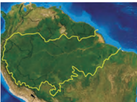
The Amazon Rainforest

South America is the fourth largest continent in the world. Most of the people inhabit its western and eastern coasts due to its topography. In comparison to other continents, South America has an extremely short coastline.