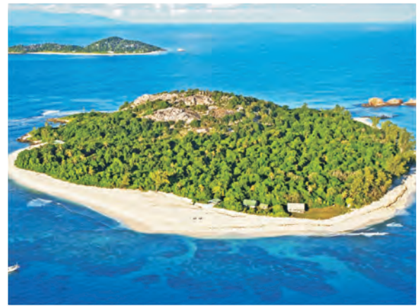
The Great Barrier Reef is home to diverse marine ecosystems

The world's largest coral reef, the Great Barrier Reef, lies on the north east coast of Australia. It is enriched with different physical attributes like the Great Dividing Range and the Blue Mountains.