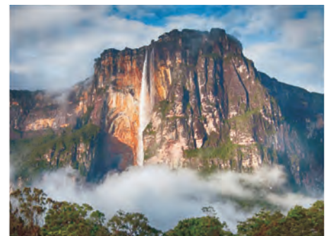
The Angel Falls

The second largest river and first in terms of the amount of water, the Amazon river, flows through this continent. The world's highest waterfall, the Angel Falls is also located here. This continent is most famous for its prosperous biodiversity in the world's largest forest : the Amazon Rainforest.